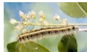
Eastern Tent Caterpillar

Look for silken webs in the crotches of plants in the Rose family such as Apple, Crabapple, and Cotoneaster. Lilacs may also be susceptible. The webs can be hand removed and the twigs sprayed with Insecticidal Soap to inhibit the growth of the ravenous caterpillars who feast on tender new leaves.