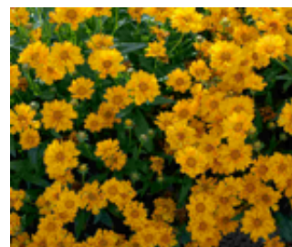
One of the many perennials available from our nursery.

We've also posted a list of perennials and a few shrubs available from our own PBOG Nursery on our website. Click here for the list. Please let us know if something catches your eye!