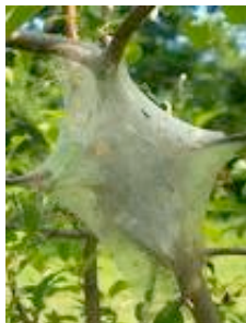
Tent Caterpillar Web

With the start of spring, it's a good idea to keep a pest