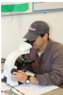
Checking on microorganisms

We take great care to brew the best compost tea possible for you, high in microorganisms that will populate your garden and give you the best results over time. A typical application schedule is spread between the months of April/May, June-August, and September/October. Here's Carmine at work in the preparation stages, behind the scenes at our workshop in West Townsend.